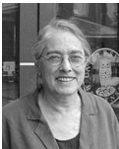
Evelyn Fox Keller